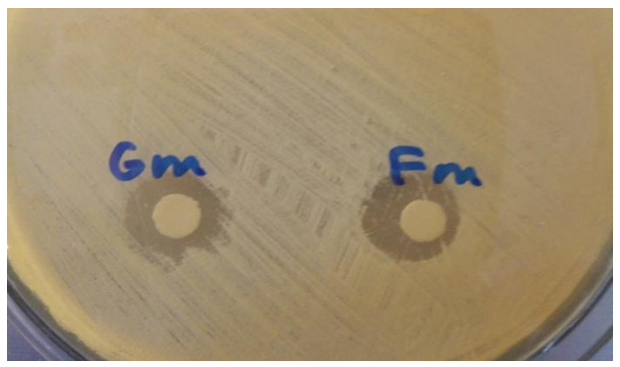
Fig. 2: Zones of inhibition of both ginger rhizome and fenugreek extracts when tested on Candida albicans . GM: Zone inhibition of ginger rhizome methanolic extract; FM: Zone inhibition of fenugreek methanolic extract

The diameters of zones of inhibition for fenugreek and ginger rhizome extracts were noticed to be smaller than those for nystatin and fluconazole ( 20.17 \pm 0.38 and 33.00 \pm 0.58 , respectively). However, There was a significant increase in these diameters by synergistic effect when ginger rhizome and fenugreek extracts were added to fluconazole. On the Contrary both extracts showed decreased zones when added to nystatin (Fig.3) (Table 1).