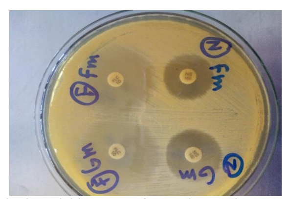
Fig. 3: Inhibition zones of both ginger rhizome and fenugreek when added to fluconazole and nystatin. N FM: Zone inhibition of fenugreek with nystatin; N GM: Zone inhibition of ginger rhizome with nystatin. F FM: Zone inhibition of fenugreek with fluconazole; F GM: Zone inhibition of ginger rhizome with fluconazole

The diameters of zones of inhibition for fenugreek and ginger rhizome extracts were noticed to be smaller than those for nystatin and fluconazole ( 20.17 \pm 0.38 and 33.00 \pm 0.58 , respectively). However, There was a significant increase in these diameters by synergistic effect when ginger rhizome and fenugreek extracts were added to fluconazole. On the Contrary both extracts showed decreased zones when added to nystatin (Fig.3) (Table 1).