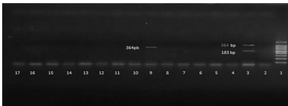
Fig. 1: Gel electrophoresis showing 100 bp DNA ladder at lane 1, 364 bp and 183 bands of macrolides resistant M. pneumoniae at lane 3 and 364 bp of macrolides sensitive M. pneumoniae band at lane 9.

bp. Of these 6 cases, only 2 cases (33%) were sensitive to macrolide while, 4 cases (66%) were resistant; showed an additional band of macrolide resistance at 183 bp (Figure 1)